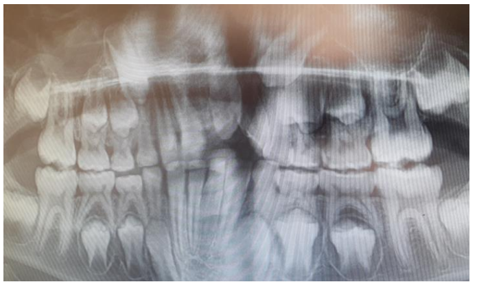
Figure 2. Radiographic Image.