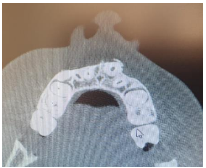
Figure 5.CT Axial View.