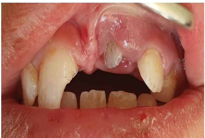
Figure 1. Intraoral view.

No conflicts of interest related to this paper.