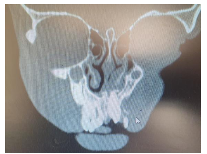
Figure 4.CT Coronal Image.